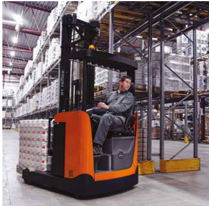
The BT Reflex B-series' controls are easy to use, making the trucks ideal for operators who carry out many other tasks during a shift. For example, the automatic parking brake and tilting forks both contribute to safety and productivity.