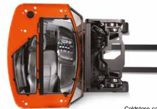
Coldstore cabin roof

The patented overhead guard design provides a clear upward view to the forks when working at height, increasing safety and productivity.