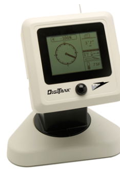
Falcon Compact Display